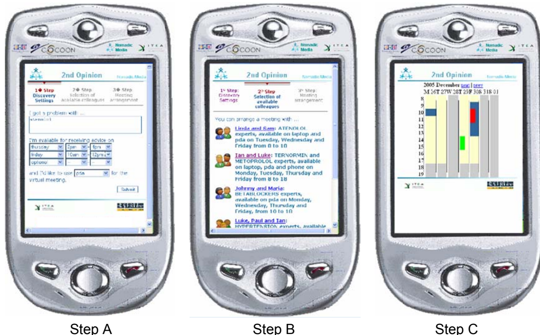
Figure 1 The application of Glue Discovery Engine for General Practitioners to book a meeting with the right specialist.

Imagine if the mail client on the GPs'/specialists' machines (or the server they use) could expose the agenda of each GP/specialist as a Web Service and that a Discovery Engine could be used by a General Practitioner to arrange a meeting with the right specialist. Glue [1], a WSMO [2] based semantic discovery engine for Web Services, was deployed within the COCOON project [6] precisely for this goal.